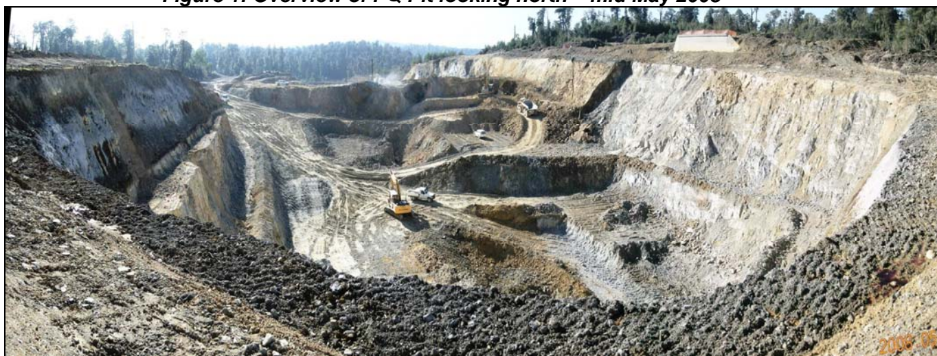
Figure 1: Overview of PQ Pit looking north – mid May 2008

1. Lost Time Injuries & Environmental Incidents – remains at nil since project inception